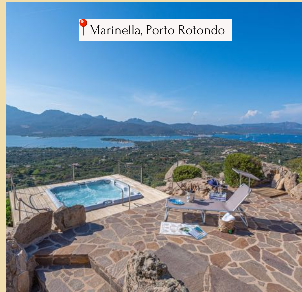
📍 Marinella, Porto Rotondo