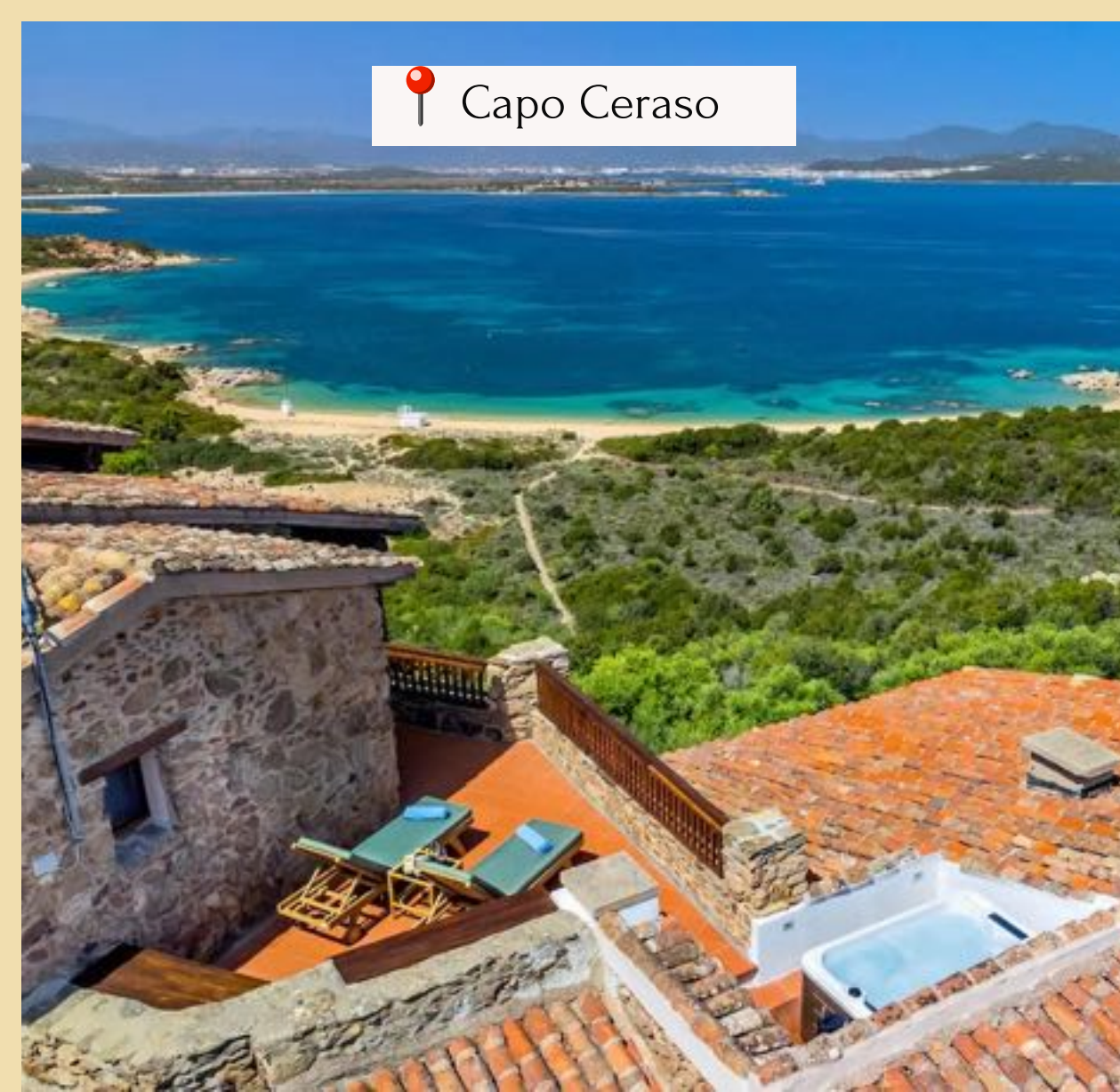
📍 Capo Ceraso