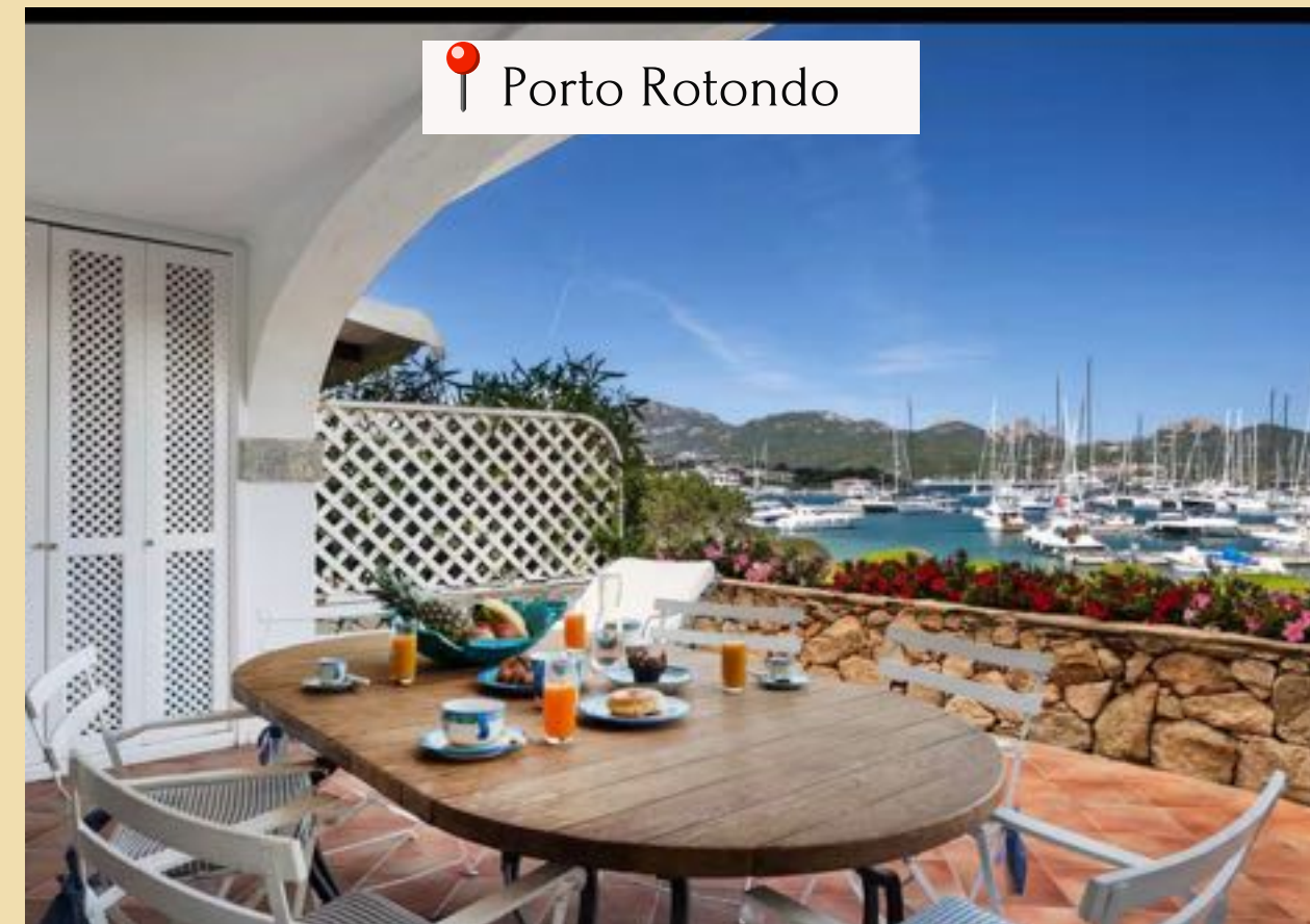
📍 Porto Rotondo