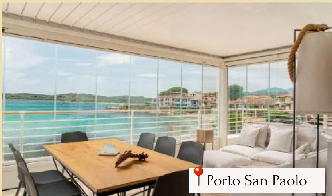
Porto San Paolo